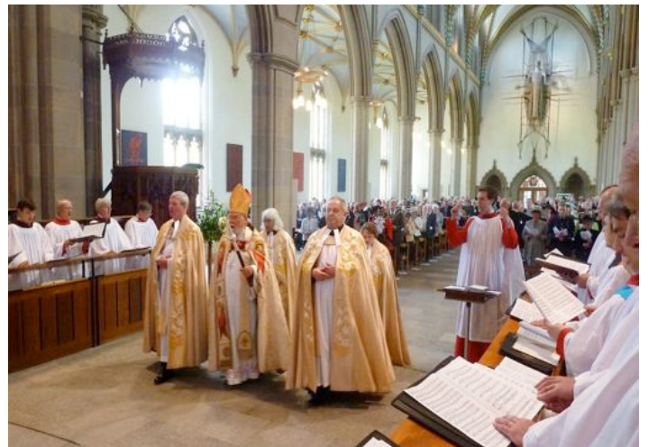
The Procession of the Dean and Canons with the Bishop of Burnley