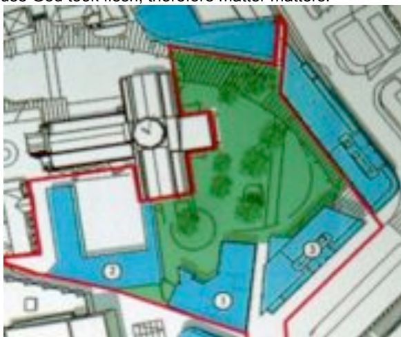
Plans for the new Close, showing an extension at the East end (in green) to where part of the bus station now is, and new buildings (in blue). 1 is the new hotel, 2 is the new cathedral building and 3 is the new office block.

Because God took flesh, therefore matter matters!