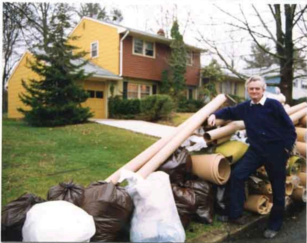
(Above) Ex-rated carpets outside my house