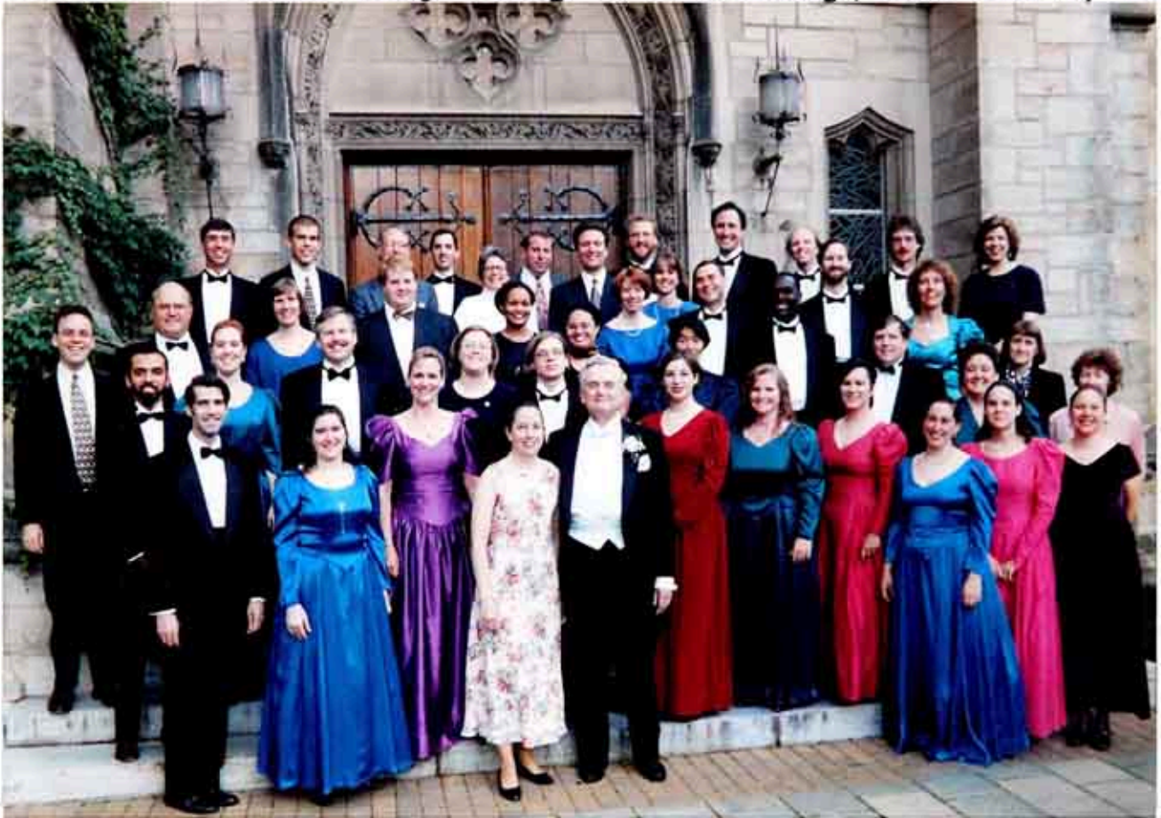
The packed audience gave us three standing ovations! A record!

Here comes At-Leasta-Thrilla-Month since my last Newsletter. Make the most of your last dose, dear Newsletter addicts!